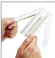
Open Pan-Wrap™ Tool and insert bundle.