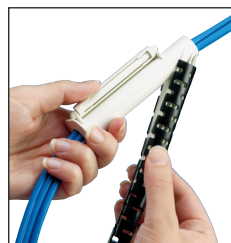
Slide Pan-Wrap™ Split Harness Wrap onto end of tool until approximately 3" of it covers the bundle.