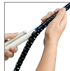
Grasp end of Pan-Wrap™ Split Harness Wrap and bundle while pulling the tool along the bundle length.