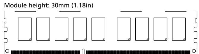
Figure 1: 240-Pin UDIMM (MO-269 R/C E)