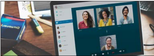
5G Networking/Telecommunications Communication Modules (WiFi Routers and Mesh Devices)