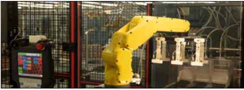
Industrial IoT / Robotics & Factory Automation