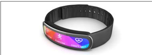
Wearables (Smart Watches, Health Monitors, AR & VR)