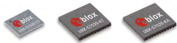
UBX-G7020-CT 3.0 x 3.4 x 0.36 mm UBX-G7020-KT 5.0 x 5.0 x 0.59 mm UBX-G7020-KA 5.0 x 5.0 x 0.59 mm