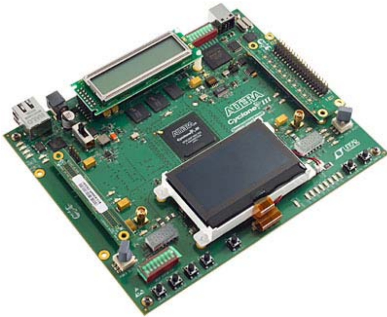
Figure 2 shows the data conversion HSMC.