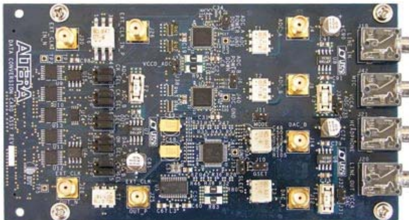
Figure 2. Cyclone III Data Conversion HSMC

Figure 2 shows the data conversion HSMC.