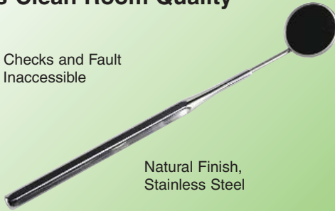
Natural Finish, Stainless Steel

For Visual Checks and Fault Finding at Inaccessible Locations