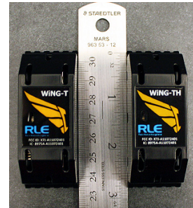
WiNG-T & WiNG-TH