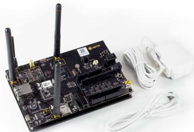
ARTIK 5 DEVELOPER KIT CONTENTS (ABOVE)