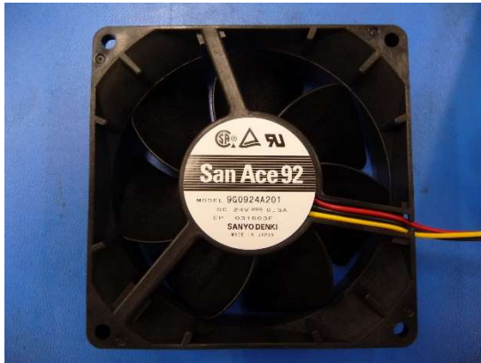
Reference model: 9G0924A201

Due to the heavy weight construction of the impeller top, a brown compound may be added for rotor balancing purposes as shown below.