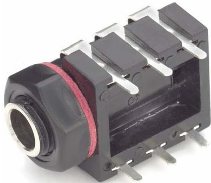
Model 7158 Horizontal 3-Conductor Jack, PC Board Mount