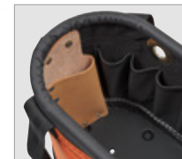
5144HBS Knife Sheath