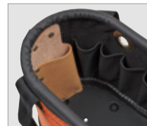
5144HBS Knife Sheath