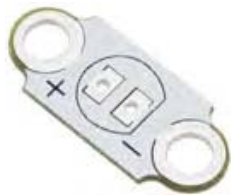
Dimensions: L18 x W7.5mm