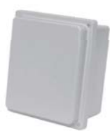
PJ Raised Lid Polyester Enclosure