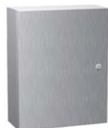
Eclipse Stainless Steel Enclosure