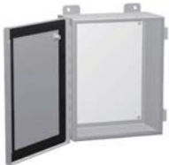
1414 NEMA 4 PH Enclosure

The Eclipse Junior Series, features a crisp, modern design. The EJ provides an efficient quarter turn latch system; an easy-ground galvanized back panel and an FTC style lip for superior protection against flowing liquids. The EJ is conveniently offered with a combined Type 12 and 4 rating.