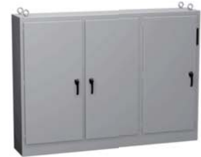
UHD Heavy Duty Disconnect Enclosures