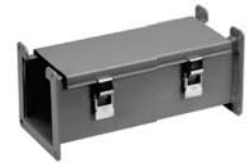
1485 Wiring Trough