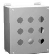
1437 Pushbutton Enclosure