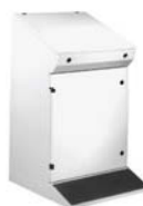
Series 2000 Console