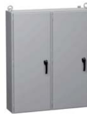
2UD Double Door Disconnect Enclosures