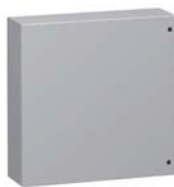
Eclipse Single Door Enclosure