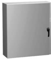
EN4DSC Single Door Disconnect Enclosure