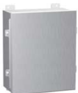
1414 NEMA 4X Stainless Steel Enclosure

Choosing the appropriate construction material is important, as the NEMA 4X rating is not a guarantee to corrosion resistance in all circumstances. Acids, alkalis and solvents react differently to different materials. With our wide and varied offering, Hammond can help guide you to the proper selection.