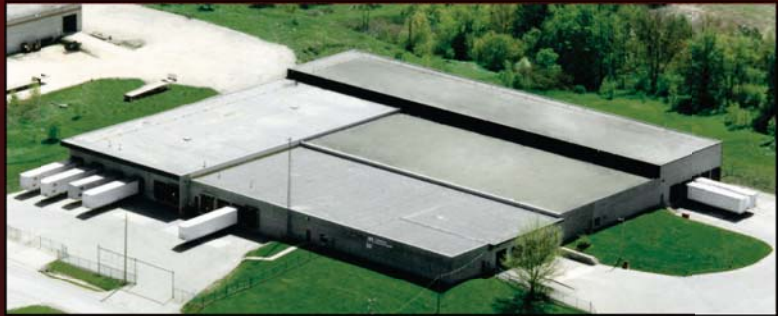
Hammond Distribution Center

We've committed our people and resources to ensuring you get exactly what you need, when you need it.