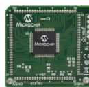
dsPIC33CH Motor Control PIM (MA330039) for MCLV-2, MCHV-3 Boards