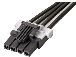
Mini-Fit TPA Single-Row 4-Circuit Cable Assembly