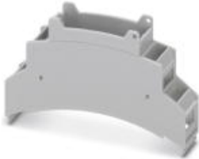
Upper part for installation housing BC, prepared for application of MKDSO connection method, width: 17.8 mm

Please be informed that the data shown in this PDF Document is generated from our Online Catalog. Please find the complete data in the user's documentation. Our General Terms of Use for Downloads are valid ( http://phoenixcontact.com/download )