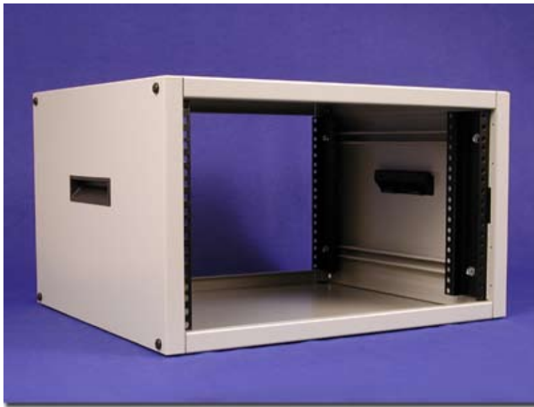
Light Gray (Textured)