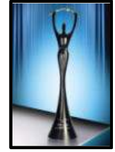
Elektra Award 2005