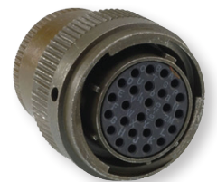
KPSE | MIL-DTL-26482 Series I / VG95328