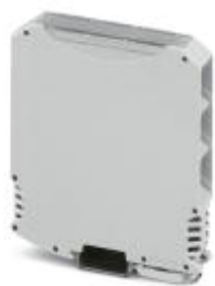
DIN rail housing, Complete housing with metal foot catch, tall design, with vents, width: 17.5 mm, color: light gray (7035)

Please be informed that the data shown in this PDF Document is generated from our Online Catalog. Please find the complete data in the user's documentation. Our General Terms of Use for Downloads are valid ( http://phoenixcontact.com/download )