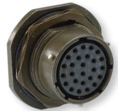
KPT | MIL-DTL-26482 Series I

KPT/KPSE connectors conform to MIL-C-26482 with a positive three point bayonet coupling, five-keyway polarization and high insert arrangement contact density. They are environmentally sealed, fully intermateable and accept a wide range of interchangeable accessories.