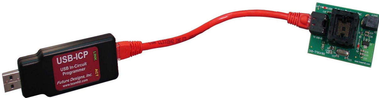
USB-ICP-LPC2K shown with SAB-TFBGA180 (USB-ICP Sold Separately)