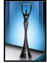
Elektra Award 2005