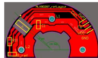
Layout example : Half size single layer pcb