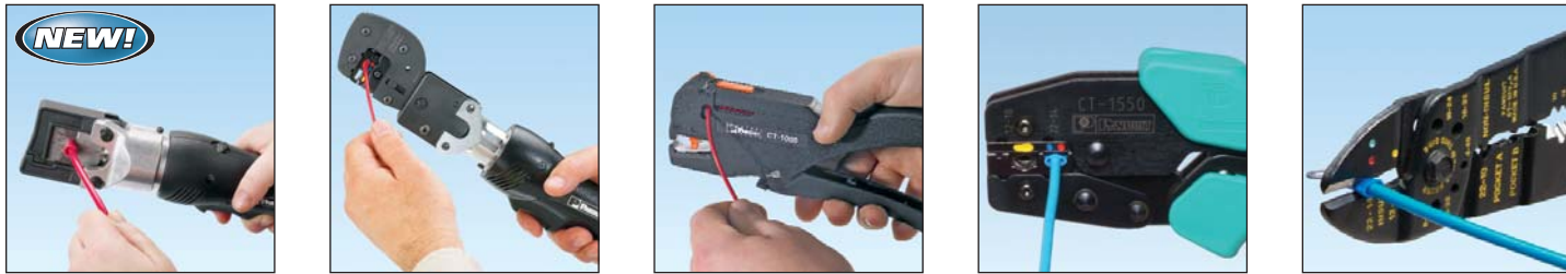
Battery Powered Hydraulic Crimping Tool CT-2600