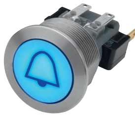
MSM 19 CS LE BL blue Lettering Example for Positive Lettering