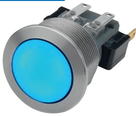
MSM 19 CS BL blue