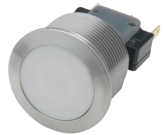
MSM 22 CS ST