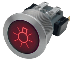
MSM 19 CS LE BL red Lettering Example for Negative Lettering