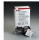
3M™ Respirator Cleaning Wipe