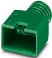
RJ45 bend protection sleeve, for pin insert VS-08-ST-RJ45, cable cross section up to 6 mm, color: green

Please be informed that the data shown in this PDF Document is generated from our Online Catalog. Please find the complete data in the user's documentation. Our General Terms of Use for Downloads are valid ( http://download.phoenixcontact.com )