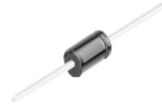
AXIAL LEAD CASE 017AG