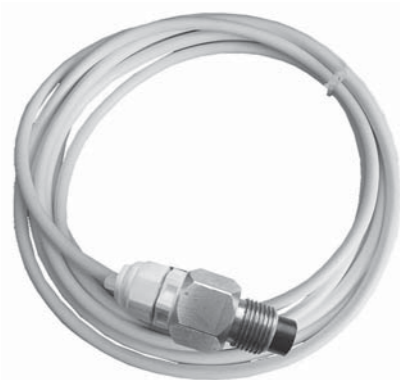
EAN code SHR-3: 8595188111270