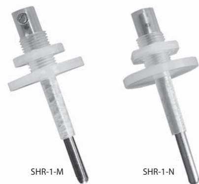
EAN code SHR-1-M: 8595188110105 SHR-1-N: 8595188111379