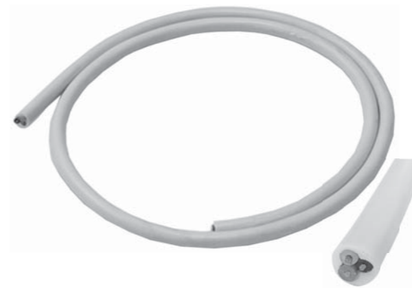
EAN code D03VV-F 3x0.75/3.2: 8595188165884