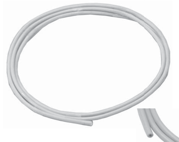
EAN code D05V-K 0.75/3.2: 8595188165945