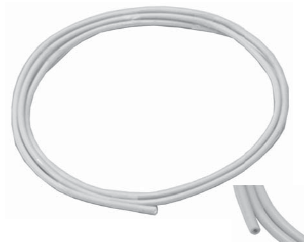
EAN code D05V-K 0.75/3.2: 8595188165945