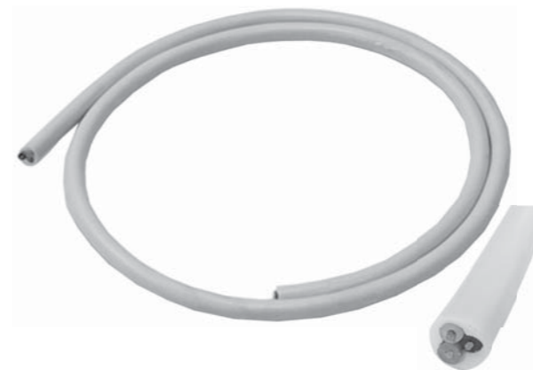
EAN code D03VV-F 3x0.75/3.2: 8595188165884