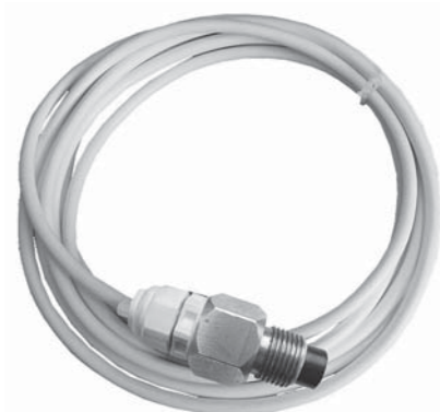
EAN code SHR-3: 8595188111270