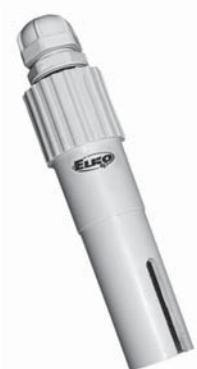
EAN code SHR-2: 8595188111263