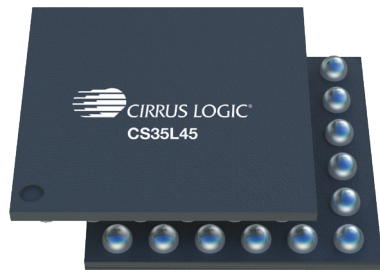
CS35L45 (36-ball WLCSP package)

Enables Maximum Loudness, Higher Bass and Features Next Generation Adaptive Battery Management and Speaker Protection