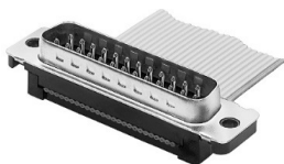
Plug- Low Profile Metal Shell