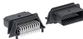
R/A Headers and Unshrouded Headers Available