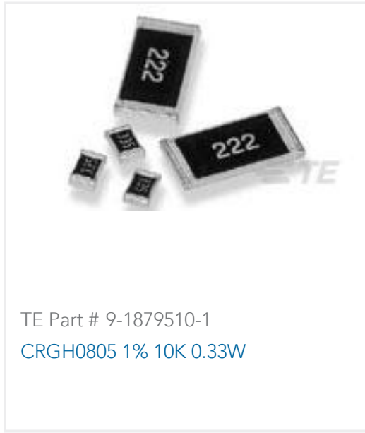
TE Part # 9-1879510-1 CRGH0805 1% 10K 0.33W