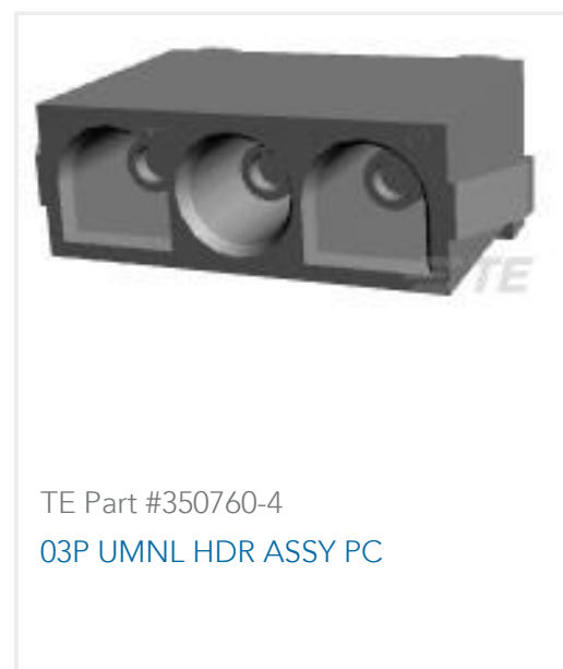
TE Part #350760-4 03P UMNL HDR ASSY PC