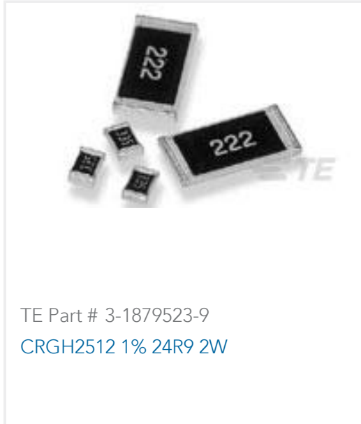
TE Part # 3-1879523-9 CRGH2512 1% 24R9 2W