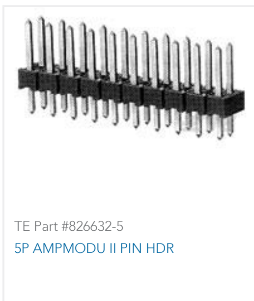
TE Part #826632-5 5P AMPMODU II PIN HDR