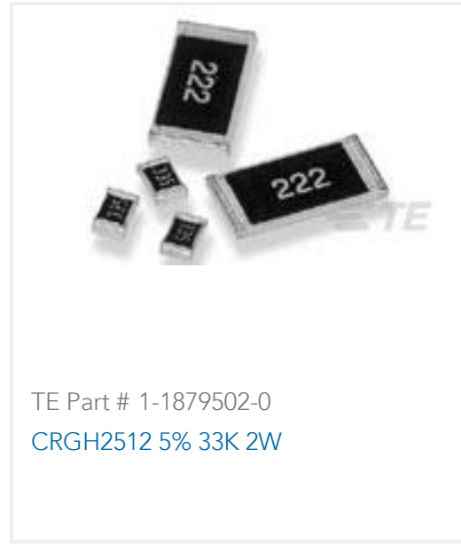
TE Part # 1-1879502-0 CRGH2512 5% 33K 2W