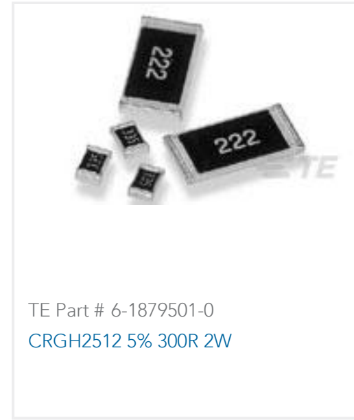
TE Part # 6-1879501-0 CRGH2512 5% 300R 2W