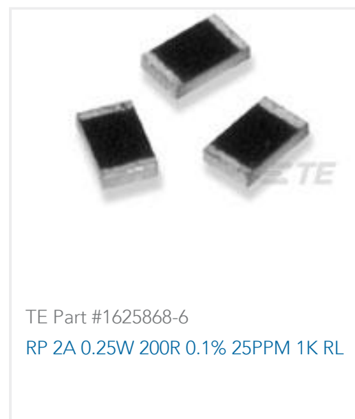
TE Part #1625868-6 RP 2A 0.25W 200R 0.1% 25PPM 1K RL