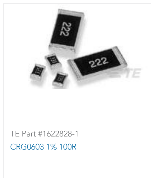
TE Part #1622828-1 CRG0603 1% 100R