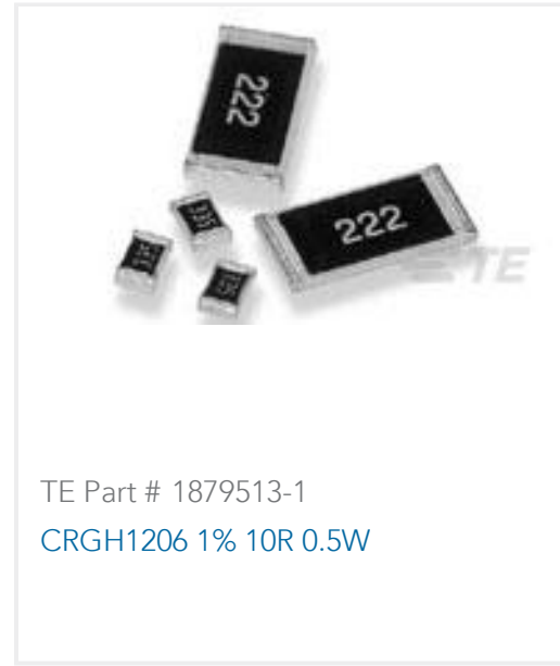
TE Part # 1879513-1 CRGH1206 1% 10R 0.5W