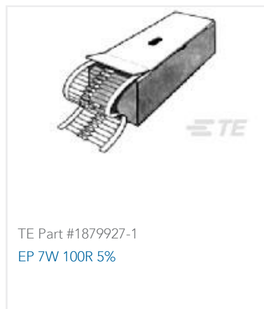
TE Part #1879927-1 EP 7W 100R 5%