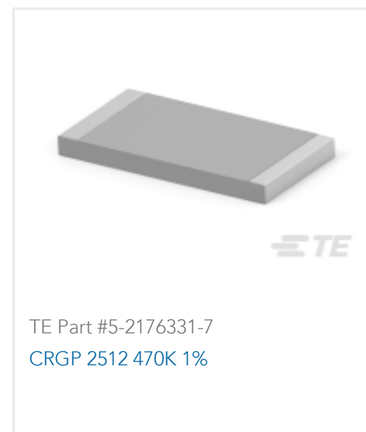
TE Part #5-2176331-7 CRGP 2512 470K 1%