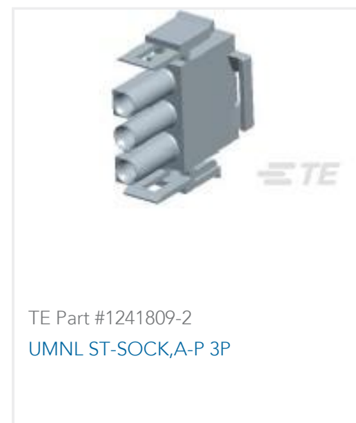
TE Part #1241809-2 UMNL ST-SOCK,A-P 3P