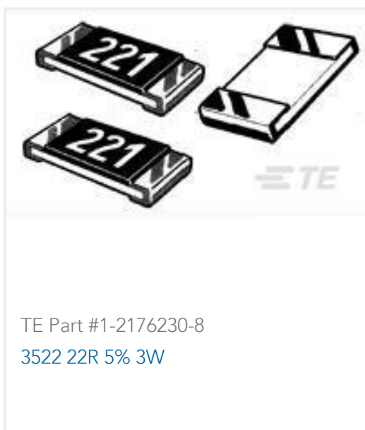
TE Part #1-2176230-8 3522 22R 5% 3W