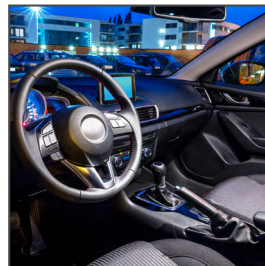
Automotive Interior Lighting