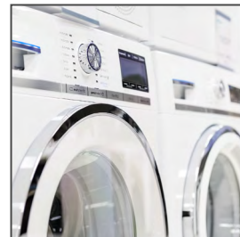
Washers and Dryers