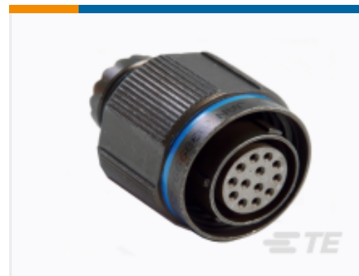
TE Part #YDTS26F17-35SAV001 PLUG ASSY