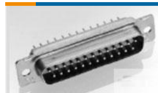
TE Part #443976-4 AMPLIMITE,ASY,RCPT,POSTD,109,4