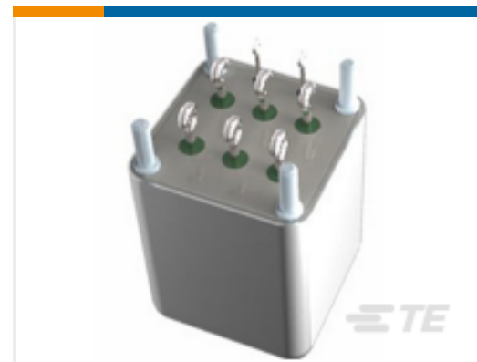
TE Part #4-1617806-1 FC-325-2=MS27418-1B