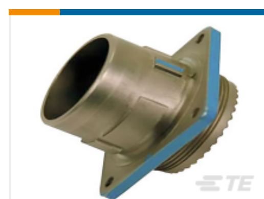
TE Part #YDIV40E21-41PNC009 RECP ASSY