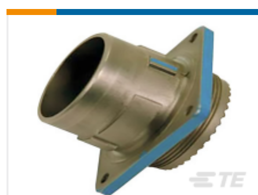
TE Part #YDIV40E21-35SNC009 RECP ASSY