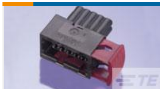
TE Part #2-967239-1 JPT GEH KPL 2P