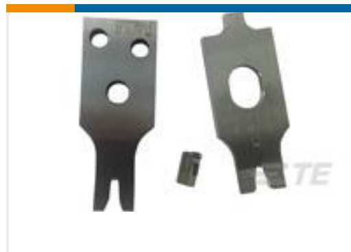
TE Part #7-2151493-7 OCEAN_2.0_SPARE_PART_KIT-055F0720