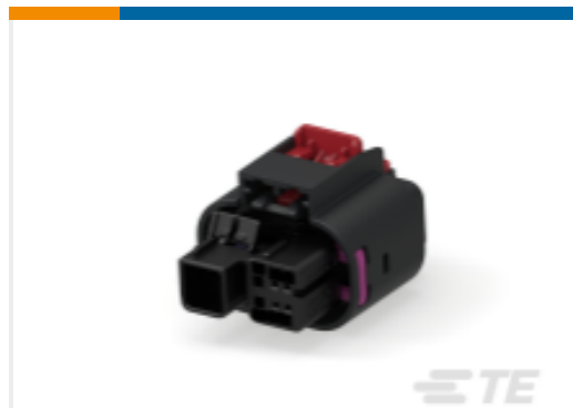
TE Part #2387380-1 Lidar Plug, Matenet+Power+signal, cod A