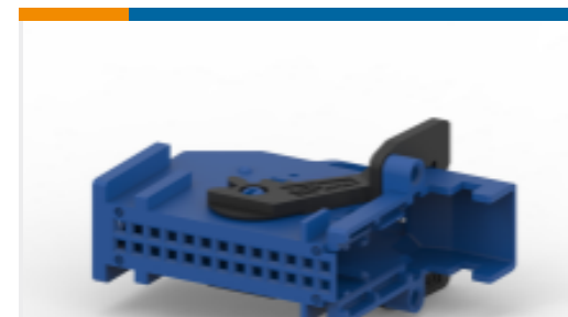
TE Part #1-185879-2 26W MQS COVER ASSY BLUE