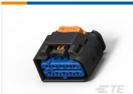
TE Part #1801600-3 RECEPTACLE HOUSING, MCON, 10 W, SEALED