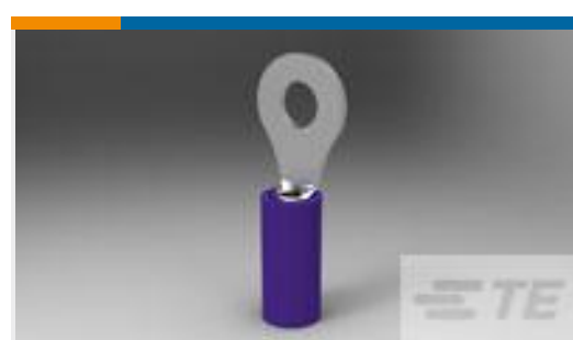
TE Part #152895 20 PIDG RT NO 6 STUD PURPL