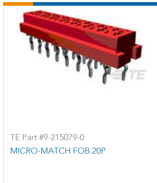
TE Part #9-215079-0 MICRO-MATCH FOB.20P