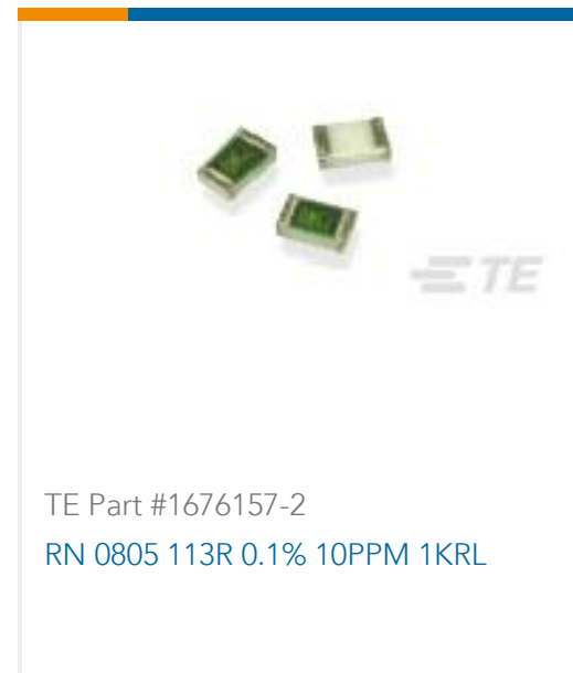
TE Part #1676157-2 RN 0805 113R 0.1% 10PPM 1KRL