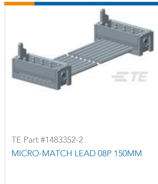
TE Part #1483352-2 MICRO-MATCH LEAD 08P 150MM