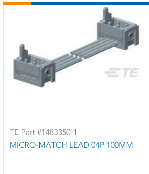
TE Part #1483350-1 MICRO-MATCH LEAD 04P 100MM