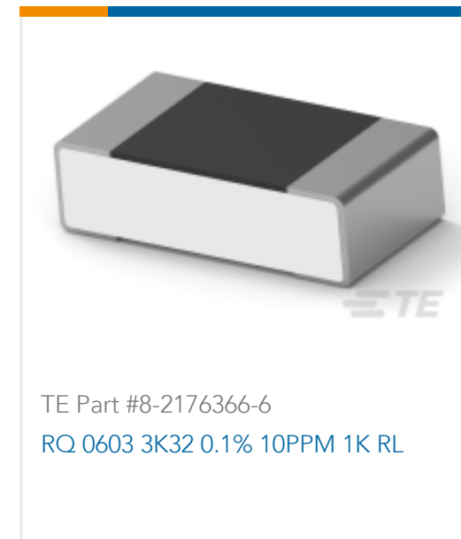
TE Part #8-2176366-6 RQ 0603 3K32 0.1% 10PPM 1K RL