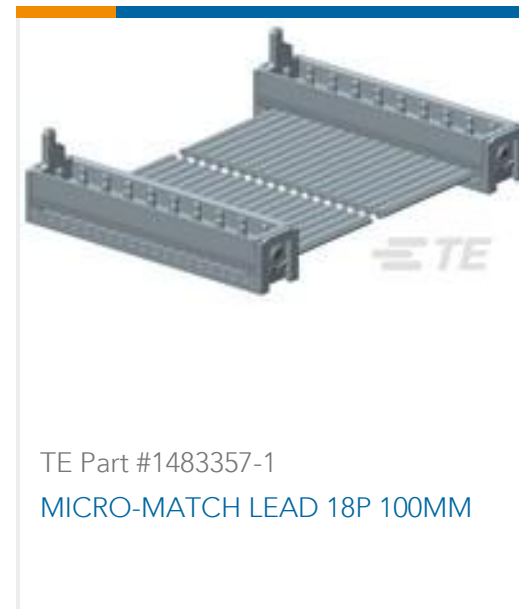
TE Part #1483357-1 MICRO-MATCH LEAD 18P 100MM