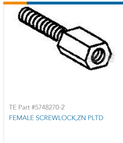
TE Part #5748270-2 FEMALE SCREWLOCK,ZN PLTD