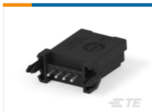
TE Part #2-1379165-1 4pos MQS .63 header 180deg THR