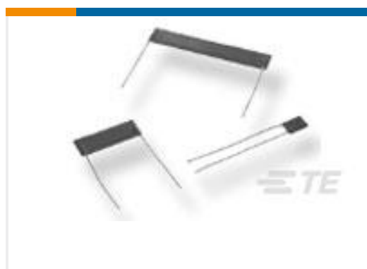
TE Part #1-1625958-5 HB01RE 1M0 1% 100PPM