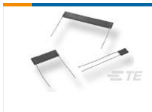
TE Part #2-1625958-6 HB01RE 300K 1% 100PPM