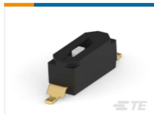
TE Part #6-2319848-4 END STACK DIP1PGRECSSEALT&R