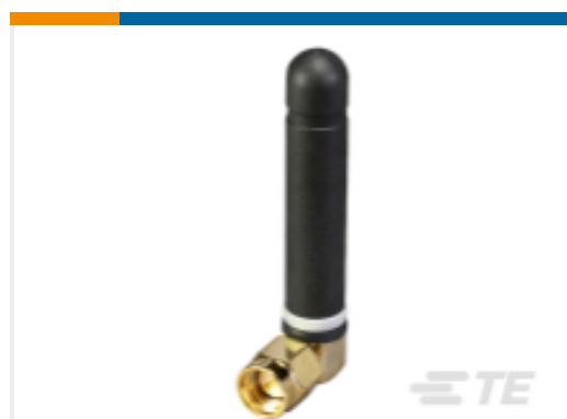
TE Part #ANT-868-CW-RAH-SMA Antenna 1/4 Wave R-Angle 868MHz SMA