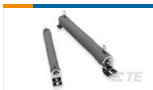
TE Part #1879457-1 TE 2500W 1R0 5% Bracket