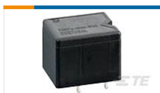
TE Part #1393277-4 V23076A1001C133