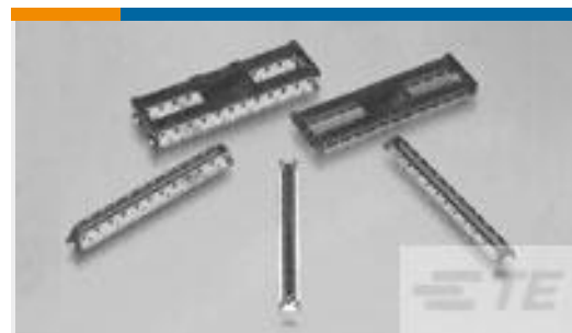
TE Part #3-1827233-6 .5FHP05H,440,B,GIG,08/Sn,HT,NS