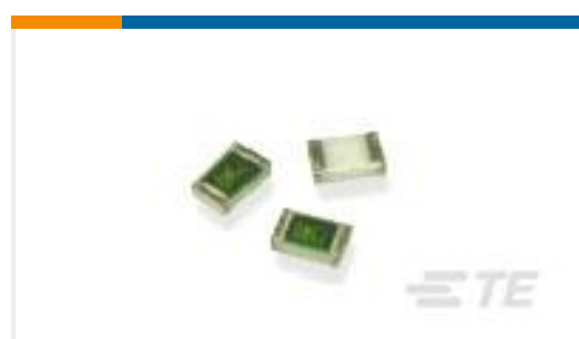
TE Part #3-2176092-3 RP 2A 0.25W 1K5 0.1% 25PPM 1K RL