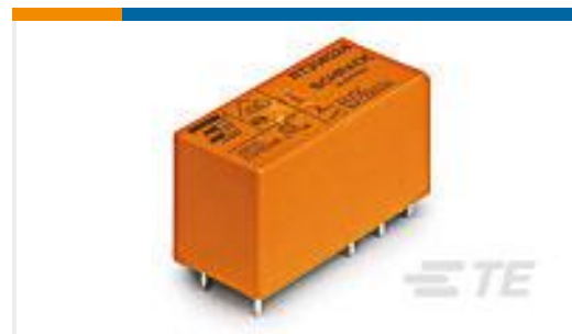
TE Part #1-1393243-0 RTE24024