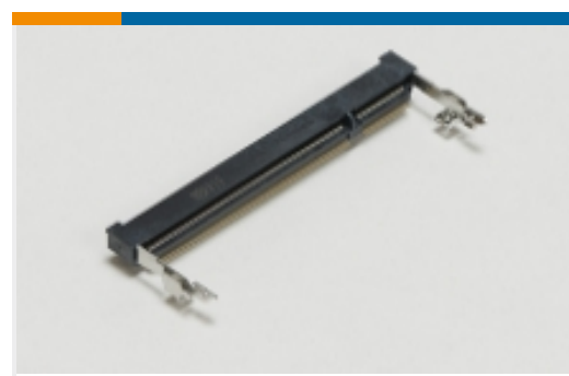
SO DIMM Sockets(39)