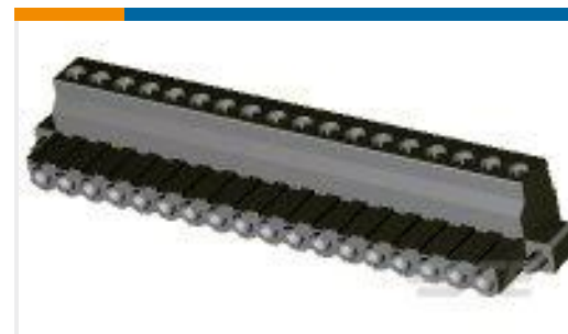
TE Part #796859-2 2 POS TERMI-BLOK PLUG RT ANGLE