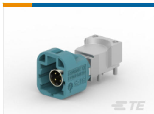
TE Part #2286546-9 HSD, HDR ASSY, 90DEG, COD Z