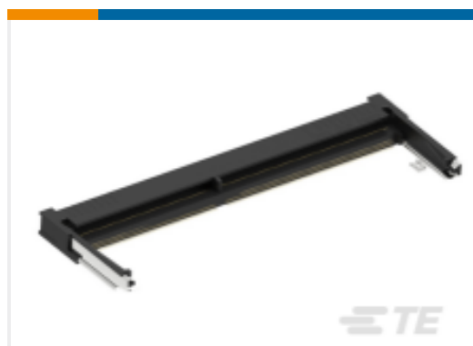
TE Part #2309409-2 DDR4 SODIMM 260P 5.2H STD