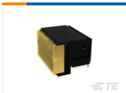
TE Part #1410326-3 MULTIGIG RT T2 7RW DC DF CT