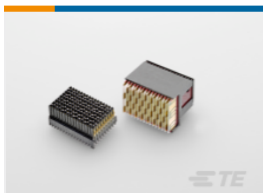
TE Part #2313237-2 RAPLUGASSY, MGRT3, POWER, DP, SE, CENTER