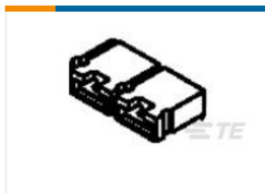
TE Part #827914-3 2P SHUNTCONNECTOR ASSY