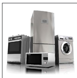
Home Appliance (White Goods)