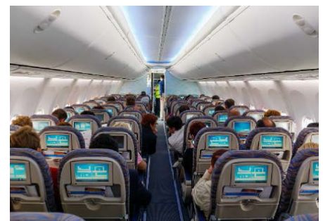
In-Flight Entertainment Systems