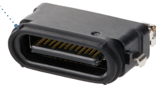
USB 3.2 Type-C Receptacle, 24 Circuit (202410 Series)