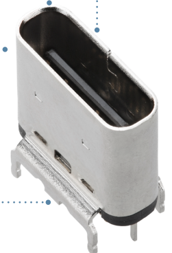
USB4 Type-C Receptacle, Vertical, 24 Circuit (204711 Series)