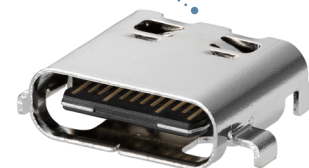
USB4 Type-C Receptacle, Mid-Mount, 24 Circuit (105455 Series)