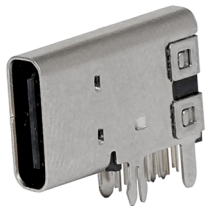
USB Type-C Receptacle, Upright, 14 Circuit (216989 Series)