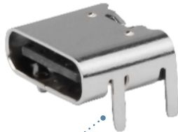
USB Type-C Receptacle, Top-Mount, 6 Circuit (217175 Series)

Long receptacle housing leads Is suitable for different PCB thicknesses to provide stable PCB connections