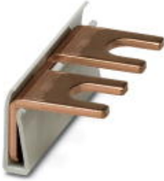
Wiring bridge for modules with connecting pitch 17.5 mm, 1-phase, 2-pos.

Please be informed that the data shown in this PDF Document is generated from our Online Catalog. Please find the complete data in the user's documentation. Our General Terms of Use for Downloads are valid ( http://download.phoenixcontact.com )