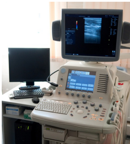
Medical diagnostic equipment