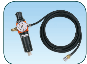
Pneumatic Tool Accessories