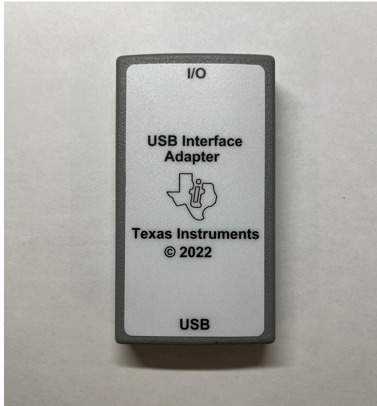
Figure 2-1. USB Interface Adapter