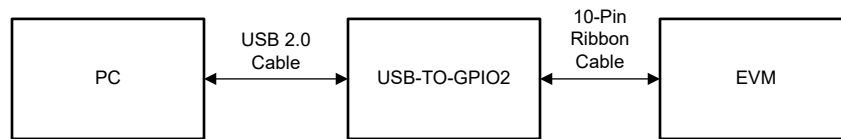
Figure 3-1. Simplified Connection Block-Diagram