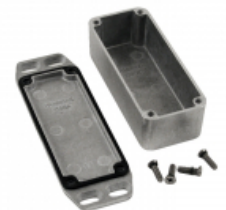
Water-tight versions and gasket upgrades available for most sizes.