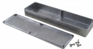
Lap joint construction where lid and box meet.