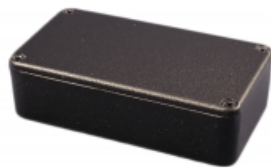
No mounting flanges