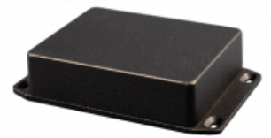
Wall-mounting flange integrated into lid.