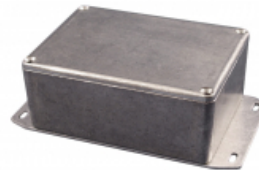
Spot-welded bottom flange